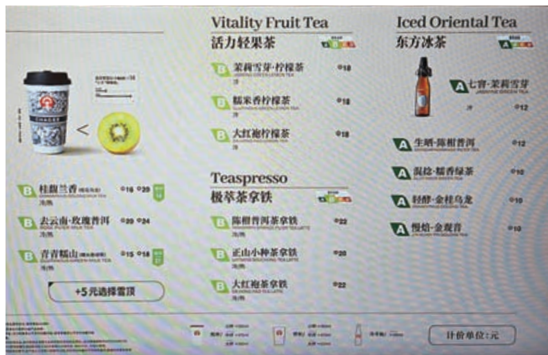
The Nutri-Grade label is placed next to each drink product at a Chagee outlet in Xujiahui. — Cai Wenjun

"The nutritional labels are easy to understand and very useful to remind me to choose those marked with A and B," said a customer surnamed Xu.